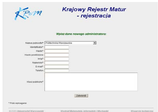
Figure 3. Registration form for the new user

The data is compressed before being signed and the output is in binary format. Given a signed document, the receiver can check the signature and recover the original data.